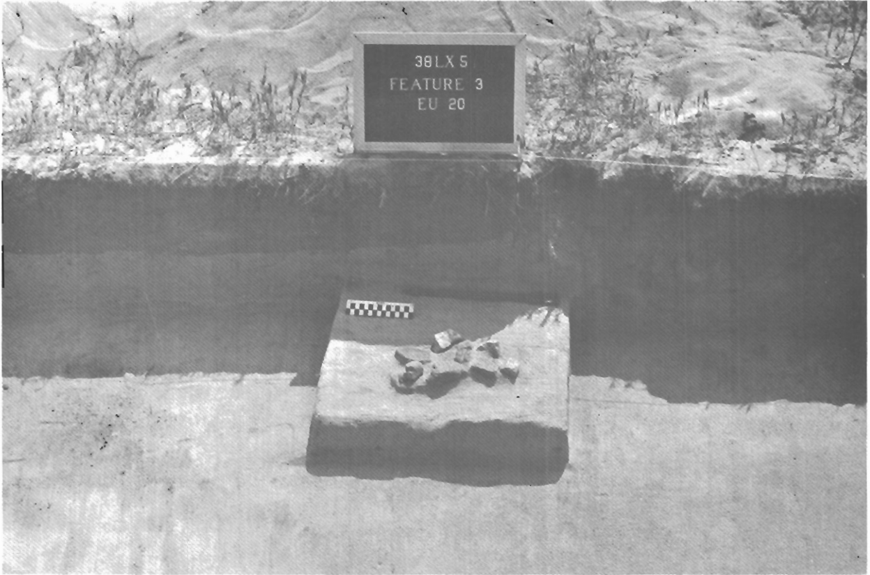
FIGURE 12— Feature 3, Test Unit 20, at 38LX5. A number of clusters of sandstone were encountered in the subplow-zone deposits and appear to be of Archaic or Early Woodland age.